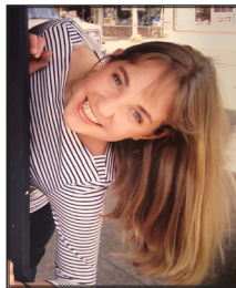
Costume, Makeup, and Hair Designer