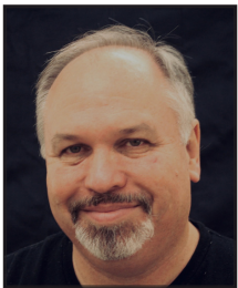
Lighting and Scenic Designer