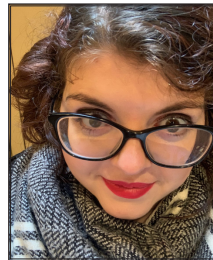
Fight and Intimacy Choreographer