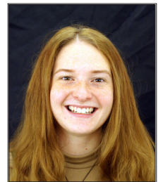
Assistant Costume Designer